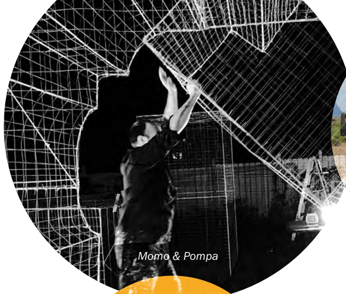
Momo & Pompa