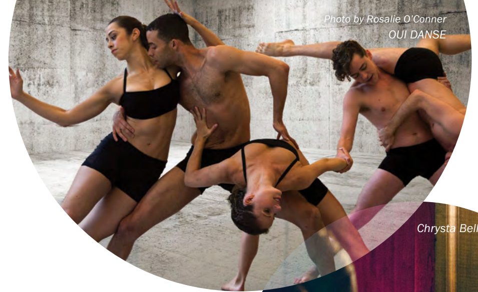
OUI DANSE