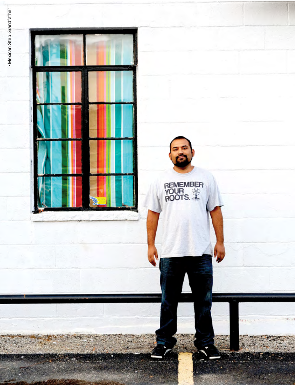
• Mexican Step Grandfather