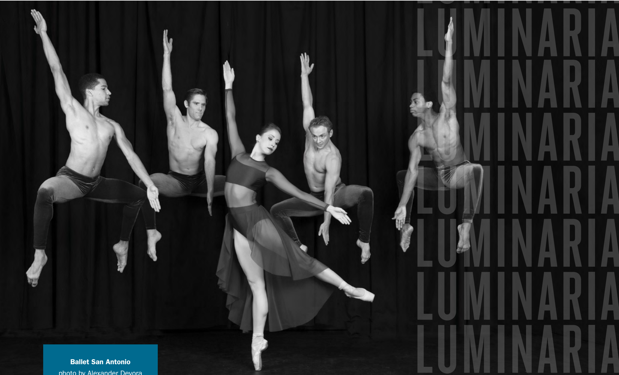
Ballet San Antonio

a fire-breathing art car, creating a joyful visual spectacle in a choreographed performance that will delight all audiences. This is the second Luminaria for ArtX, who also performed in 2011.