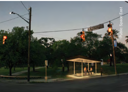
• Public Space East